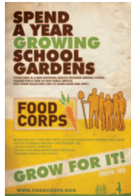
FoodCorps recruitment efforts yielded an impressive pool of 1229 applicants for 50 service member positions.

FoodCorps is implementing the web-based tracking system called America Learns to monitor the work our service members are doing on the ground. Each FoodCorps member will collect data from weekly surveys and conduct a special impact assessment project with a sample student population, tracking the change in children’s attitude toward healthy food that occurs over a year of service.