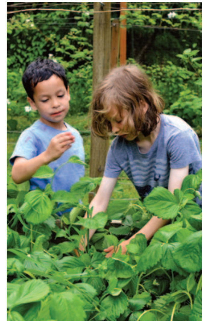
Garden education engages kids in the process of growing fruits and vegetables, which makes them more likely to try and enjoy eating them in the cafeteria.